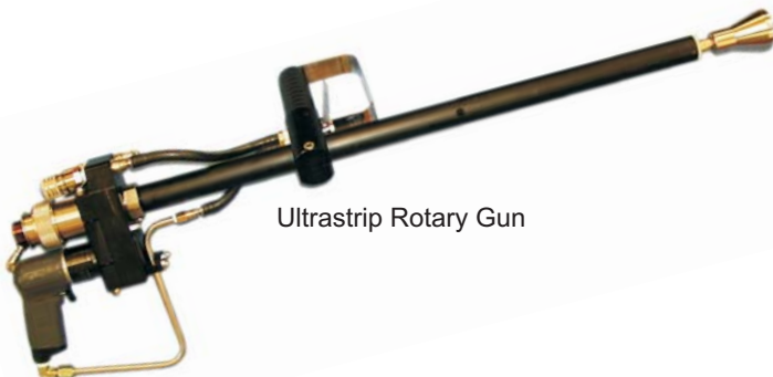
Ultrastrip Rotary Gun

Based on the Hughes HPS650 power end, this compact unit is ideal for single gun, high performance surface preparation in applications where space and water usage are at a premium.