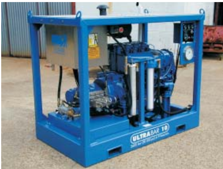
Skid mounted Ultrabar 10 with Deutz diesel engine 1.86 m long x 1.0 m wide x 1.54 m high, weight 1000 kg