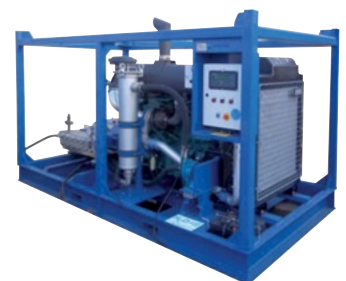
HPS5000DC unit, 200lpm at 1000bar

This information is intended to be a guide only. The required pump size & performance can vary depending on many factors including rate of work required, hardness of deposit or work piece, operator skill, site access etc.