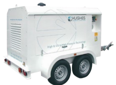
HPS2200DRT unit, 43lpm at 1400bar

Higher flowrate increases reaction force so the cutting nozzle needs to be constrained. At 120lpm at 1000bar it is common to use a gimbal device to connect the jetting gun to. For maximum productivity the HPS5000 pump with a performance of 200lpm at 1000bar is coupled to a hydrodemolition robot.