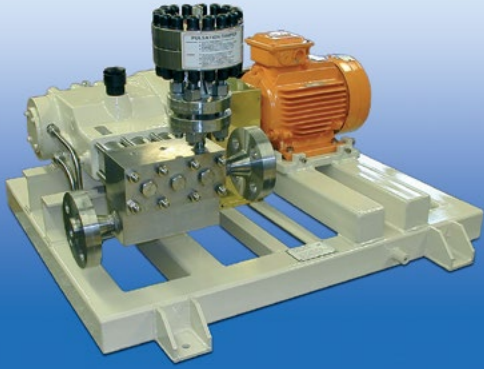
Hot condensate pump