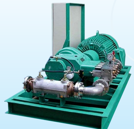
HPS3000 water injection pump

In addition to the more common triplex pump layout, five cylinder versions offer reduced flow variation for applications requiring minimum pulsation (see photo of pressure gauge above right). Close-coupled reduction gearbox drives are available, with a choice of gear ratio to suit most prime mover speeds.