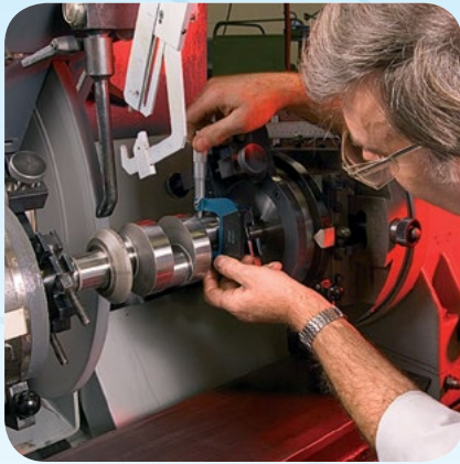
Inspection during pump crankshaft manufacture