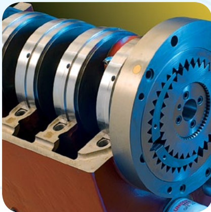
HP5000 crankshaft and oil pump assemblies