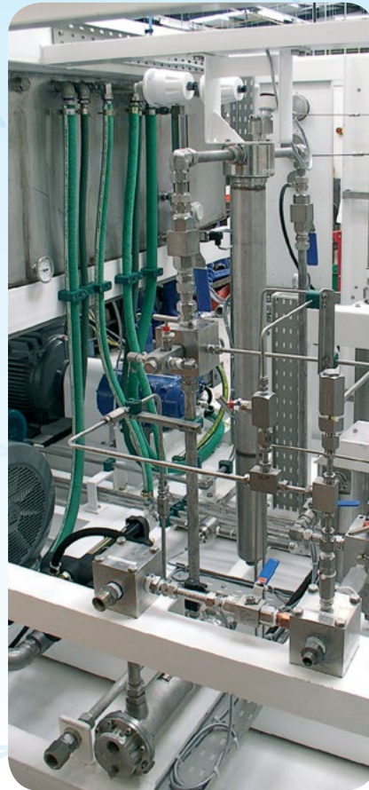
Twin HP5650 glycol pumps, flushing & pressure testing subsea umbilicals