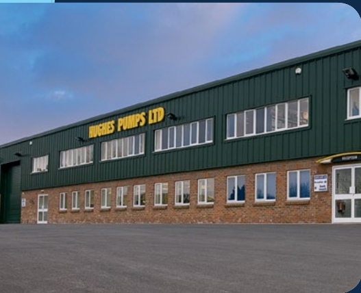
New Hughes Pumps factory constructed in 2004

The chart above shows extreme pressure/flow combinations with smallest & largest plungers fitted. All pumps have a range of plunger sizes.