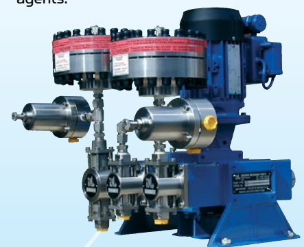
Dualway triple headed metering pump (separate brochure available)

Ancillary equipment available includes pulsation dampers, relief and loading valves, directional control valves, filtration and condition monitoring, all backed by a comprehensive spares stockholding, service engineers and worldwide network of sales / service agents.