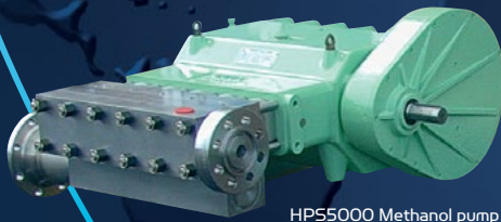
HPS5000 Methanol pump