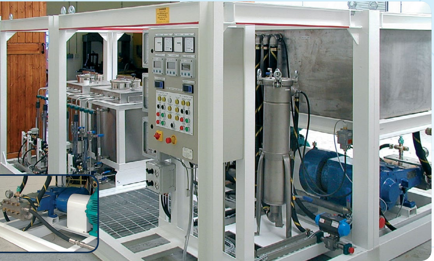
Main Picture: Subsea hydrostatic test and chemical injection system Inset: HPS2000 pump