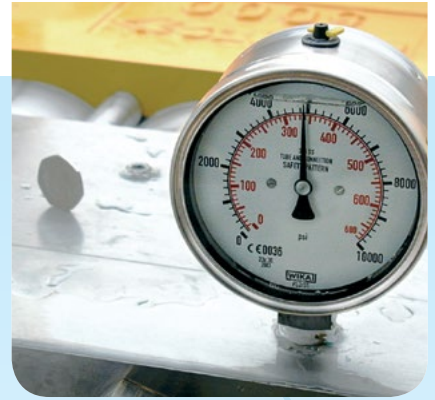
Smooth output of HP5000 pump demonstrated by balancing a coin while at full power