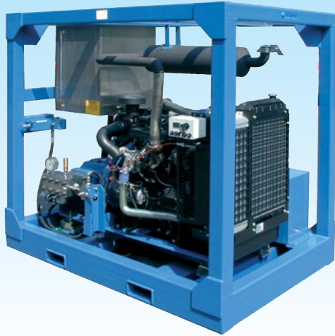
Up rated performance