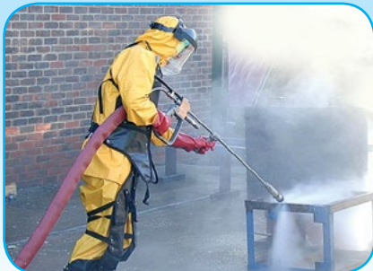
De-scaling - 28lpm / 1400 bar