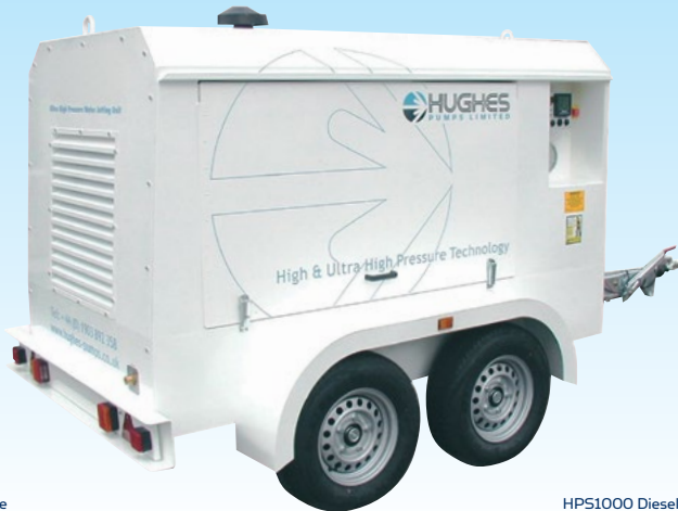
Up rated performance