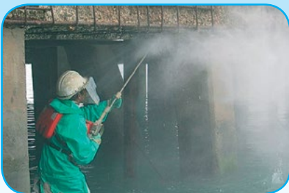
Concrete cutting - 59lpm / 1000 bar