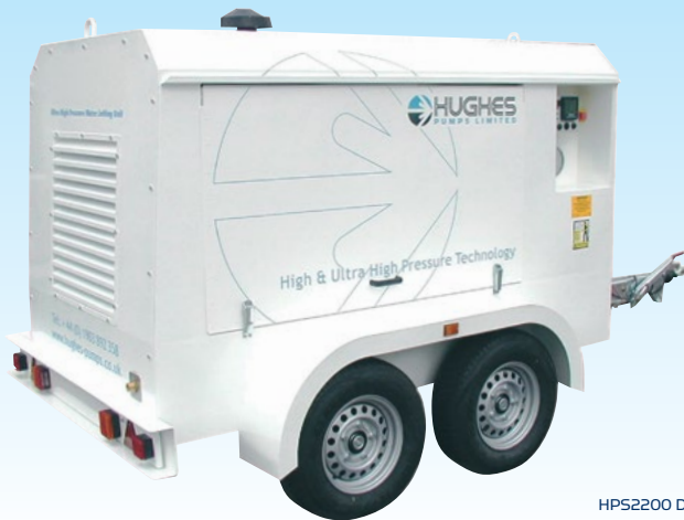
HPS2200 Diesel Road Trailer