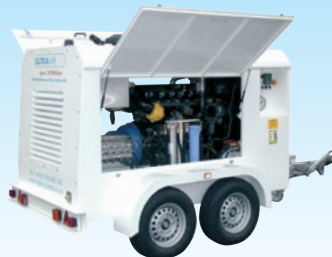
Full sized, lift-up doors for ease of access