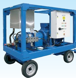
HPS2200 ECT (electric crashframe trailer)