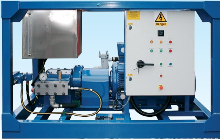
HPS2200 Electric Crashframe