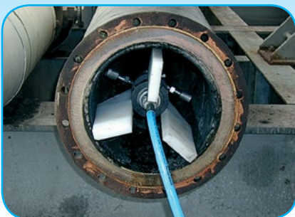
Descaling large diameter pipework - 69 lpm / 1000 bar