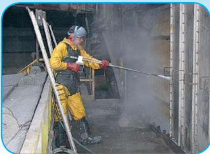
Surface cleaning at a steel works – 33 lpm / 500 bar