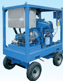
HPS400 DST (Diesel Site Trailer)