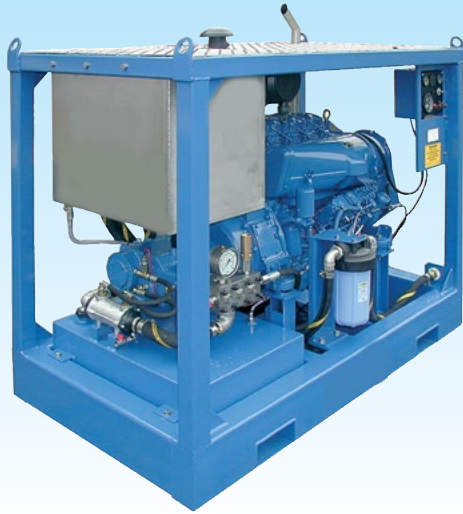
Up rated performance