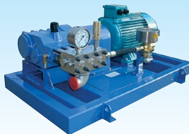
HPS400ES ( Electric Skid)