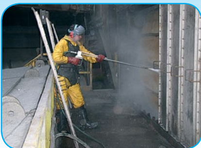
Surface cleaning at a steel works - 28 lpm / 500 bar