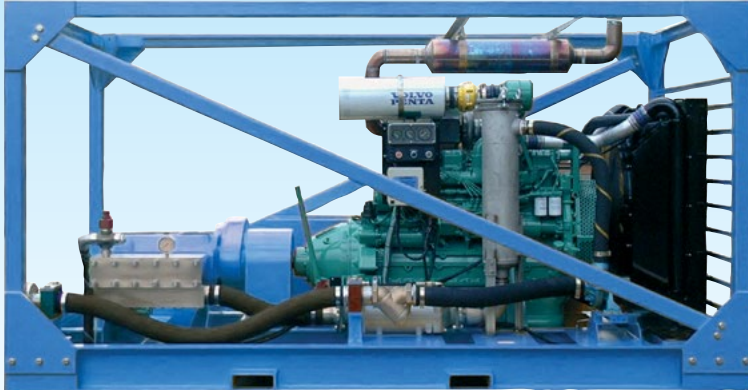
Up rated performance