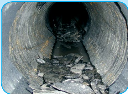
Descaling large diameter pipework – 200 lpm / 1000 bar