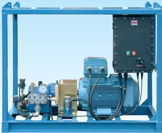
Up rated performance