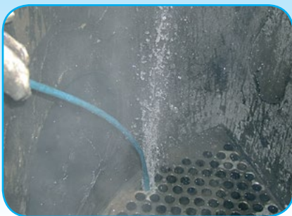
Heat exchanger cleaning - 28 lpm / 800 bar