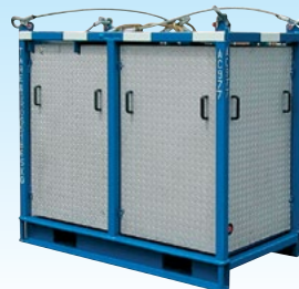
HPS650EC shown with panels and lifting slings