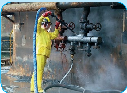
Surface preparation of intricate pipework