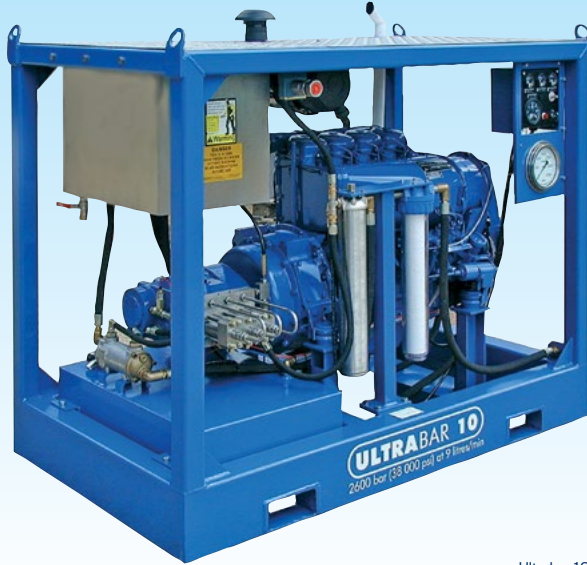
Ultrabar 10 Diesel Crashframe