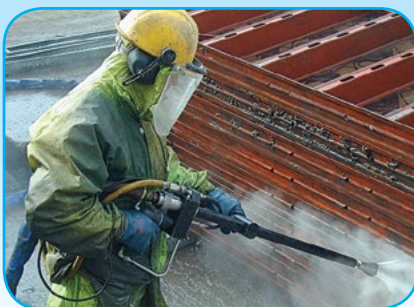
Single gun surface preparation