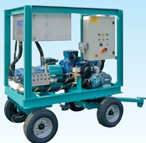
Site Trailer undergear