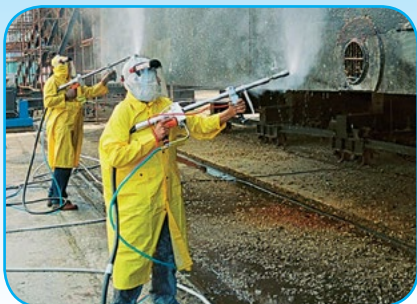
Twin gun surface preparation