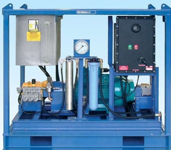
Ultrabar 24 Electric Crashframe (Ultrabar 15 shown)