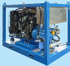
Good access for maintenance