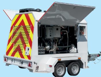
End panels remove with two screws