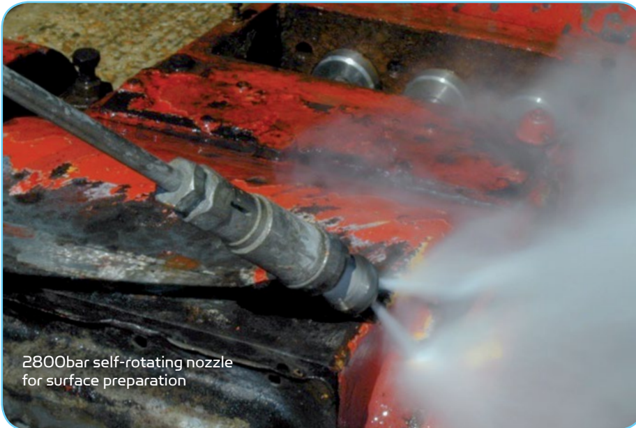
2800bar self-rotating nozzle for surface preparation