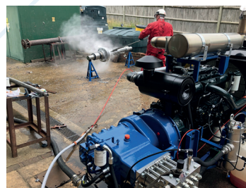
Unit during test

Hughes Pumps Limited Spring Gardens, Washington, West Sussex, RH20 3BS United Kingdom