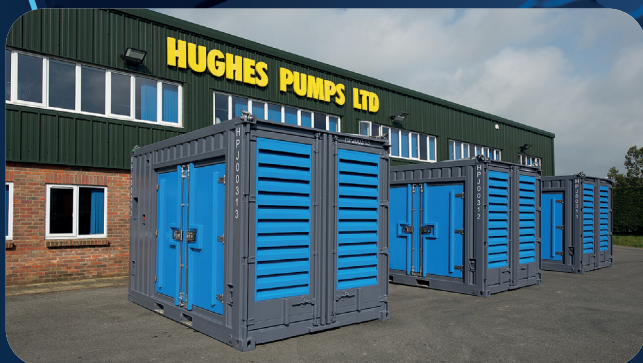
DNV 2.7-1 containerised units

The chart above shows extreme pressure/flow combinations with smallest & largest plungers fitted. All pumps have a range of plunger sizes other than the Ultrabar 10 & 15.