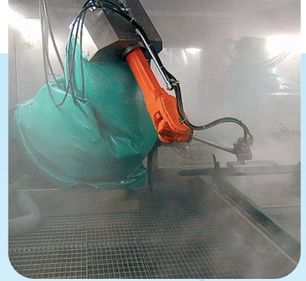
Robotic cleaning of skids at automotive plant - 900 bar.

High capacity water filters and stainless steel suction line fittings are used as standard and boost pumps fitted for higher pressure applications. Shutdown switches are fitted where necessary to monitor various pump and prime mover functions.