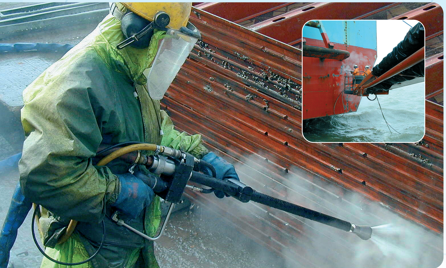
Main Picture: Stripping concrete from formwork at 2500 bar Inset: Surface preparation, shiprepair at 3000 bar