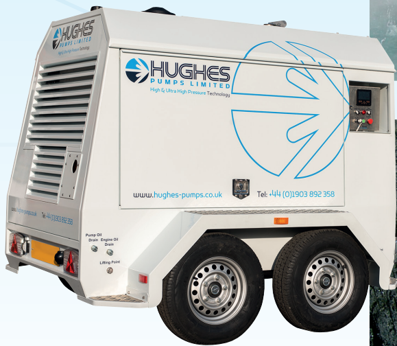
Ultra-Bar 30 DRT(4), 24lpm at 3000bar