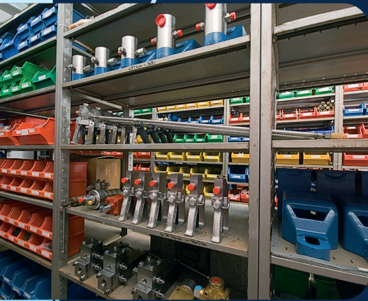
Comprehensive stock levels of accessories & spares