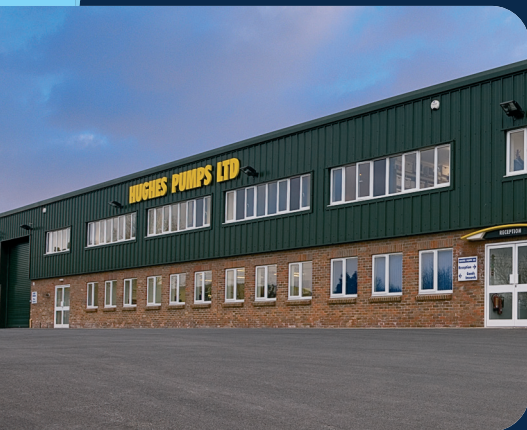
New Hughes Pumps factory constructed in 2004