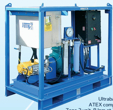
Ultra-Bar 10, ATEX compliant Zone 2 unit, 8 lpm at 2100

Backed by a comprehensive spares stockholding, we have dedicated Service Engineers who travel nationally and internationally keeping our pumps running round the clock. We also work closely with our overseas agents who have been trained in the selection, operation and maintenance of our product range ensuring they can provide the vital after sales service demanded by today's fast moving industry.