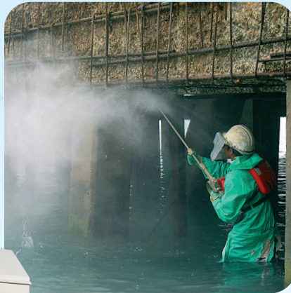
Concrete cutting - 1000 bar