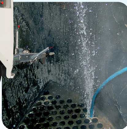
Heat exchanger cleaning - 800 bar