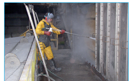
Water jetting of granulator screen, 700bar

This information is intended to be a guide only. The required pump size & performance can vary depending on many factors including rate of work required, hardness of deposit or work piece, operator skill, site access etc.