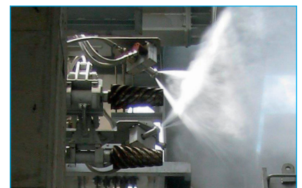
Coke oven door cleaning, 500bar