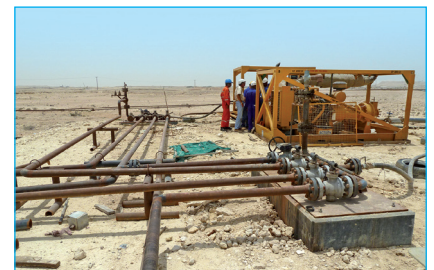
Tatweer Petroleum oilfield in Bahrain

Primary production usually only recovers 30-35% of the oil. Water injection can recover 5-50% of the oil remaining in the reservoir, greatly enhancing the productivity & economics of the development. This form of EOR is typically more productive when there are relatively small amounts of primary production.