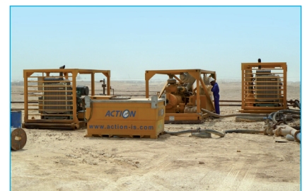
Multiple pumps linked together

This information is intended to be a guide only. The required pump size & performance can vary depending on many factors including rate of work required, hardness of deposit or work piece, operator skill, site access etc.