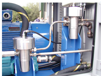
2 valves mounted in series