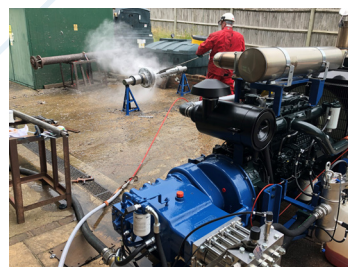
Unit during test

Hughes Pumps Limited Spring Gardens, Washington, West Sussex, RH20 3BS United Kingdom