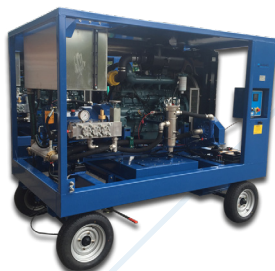
Site trailer option