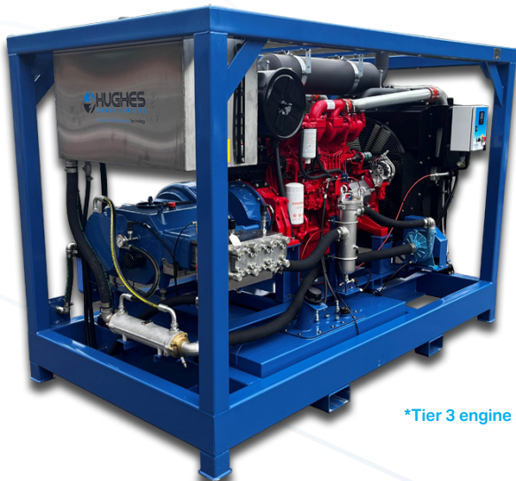
*Tier 3 engine shown*