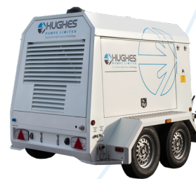
Road trailer option

Hughes Pumps Limited Spring Gardens, Washington, West Sussex, RH20 3BS United Kingdom