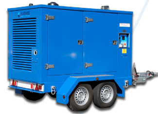
Road trailer option

Hughes Pumps Limited Spring Gardens, Washington, West Sussex, RH20 3BS United Kingdom