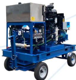
Site trailer option