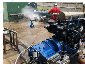
Unit during test

Hughes Pumps Limited Spring Gardens, Washington, West Sussex, RH20 3BS United Kingdom