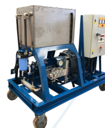
Mounted with castors

Hughes Pumps Limited Spring Gardens, Washington, West Sussex, RH20 3BS United Kingdom