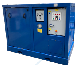
Enclosed crashframe option