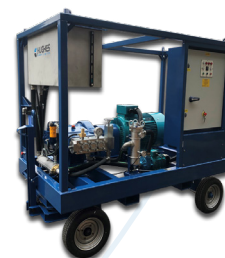
Site trailer option